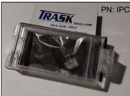
NEMA 4 / IP67 Splash Proof Cover