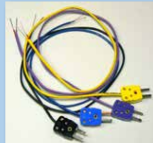
Types J, T, E, K (020-0202)

Each wire is stripped at one end with Mini T/C Plug on the other end.