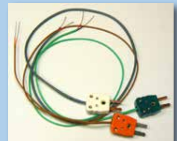
Types B, R/S, N (020-0203)

Individual Wire & Mini T/C Plug (020-0210-*) *Choose Type J, K, T, E, R/S, N or B