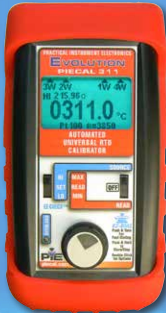
Thermocouple and RTD