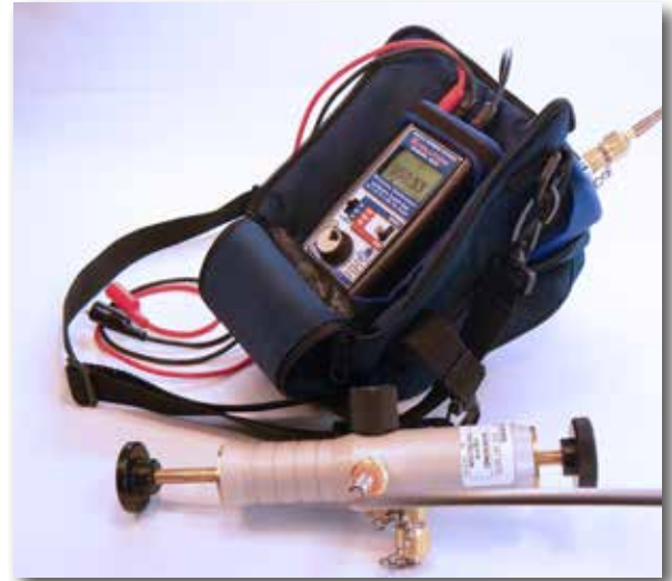
Upgraded Hands Free carrying case (020-0233) with pockets for the PIE 830/820-ELITE, the Pressure Module & a zippered pocket for the manual, test leads, hoses & pressure fittings. Included when the 830/820-ELITE & a pressure module are ordered together.

Wire & Mini T/C Plug: J, T, E, K (020-0202); B, R/S, K (020-0203); Individual Wire & Mini T/C Plug (020-0210-*) *Choose Type J, K, T, E, R, S, N or B; NiMh Batteries & Charger 120 VAC/12V DC (020-0103); calibration report with test data. Optional pressure modules are listed on page 11.