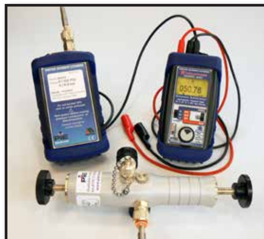
PIE 830 with Pressure Module, Pressure/Vacuum Pump & Hose

torr • kg/cm 2 • kg/m 2 • Pa • hPa • kPa • MPa • Bar • mBar • ATM • oz/in 2 • lb/ft 2